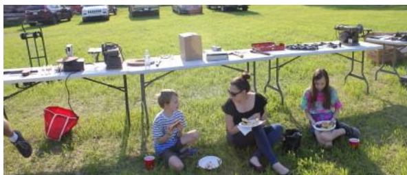
A Guild member's family enjoy their picnic meal in front of the 'Equipment Sale and/or Swap table'.