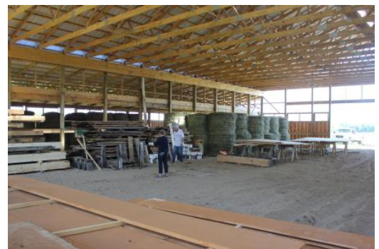
(R) A view of the inside of Pflug's massive pole barn. This large clear area is to be the riding arena for Debi Pflug's therapy ponies. To the left is a storage area. To the right (not shown) is John's saw mill and timber framing shop area, equal size to the storage area. We held our picnic behind this massive pole barn.

"Tools of Every Type on Sale" Watch our Facebook Page for More Information During September