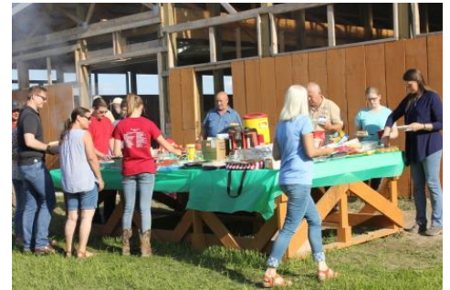
No one went hungry at this Picnic!