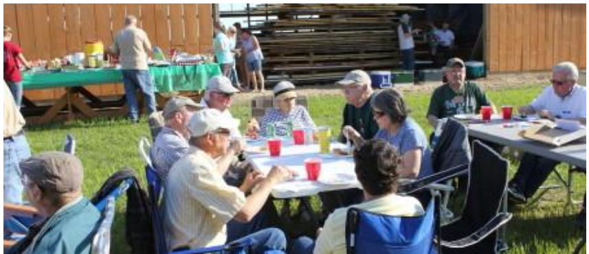
Woodworkers and their family members enjoying each others company at the picnic.