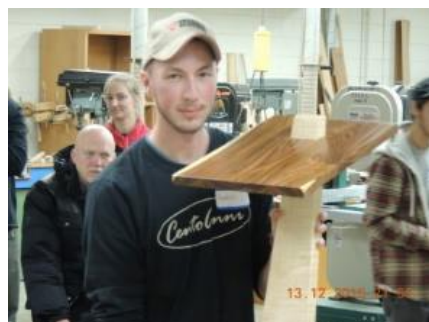
Austin Morris created a mid-century modern end table. It may look simple and straightforward but it has many angled tenon inserts that require extensive hand chisel work and careful fitting.