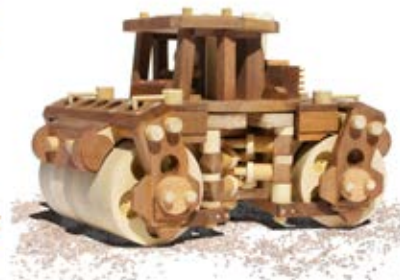
The BIG Steam Roller Plans