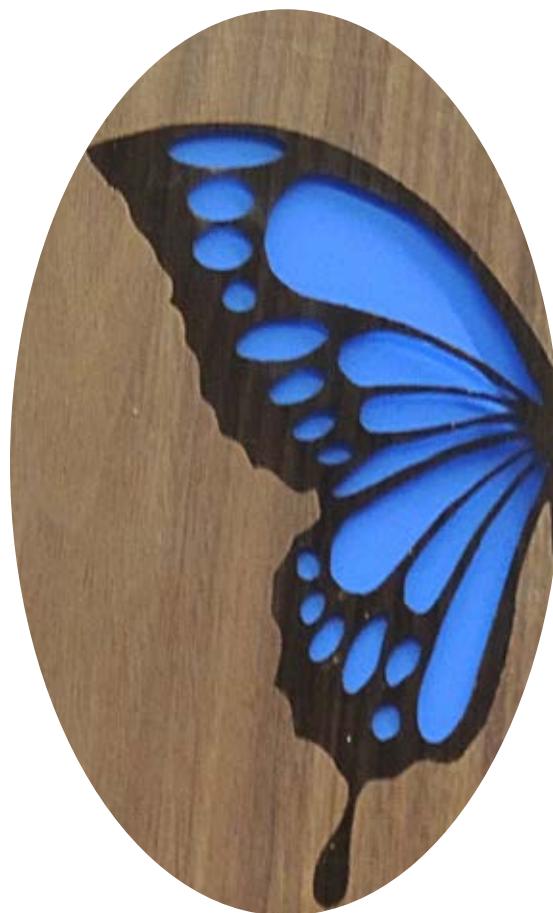
Carved wood cover journal