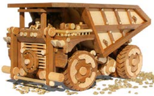
The BIG Truck Plans