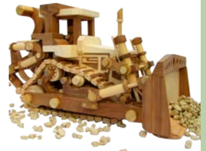
The BIG Dozer Plans

All plan books include scale drawings of every part, hundreds of procedural photographs, and complete instructions.