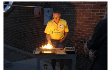
What Lichtenburg wood burning looks like after sunset.