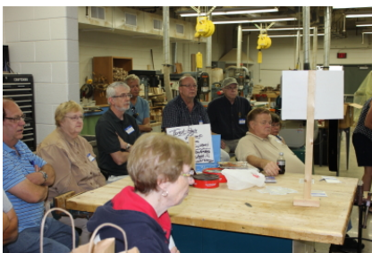
Guild Members at Guild Business Meeting on September 13, 2016