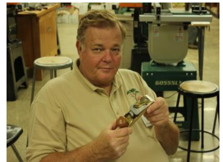
Garry Strout's new Lie-Nielsen Chisel Plane Model 1-975