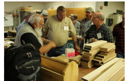
Guild Raffles and the 50/50 Drawing at the October 2016 meeting.

Thank you to all the members who provided items for the raffles at our meetings.