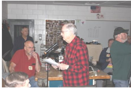
Nick Offerman giving us a book report on a book he thought we as woodworkers would enjoy reading.

Our next meeting is January 8 th . Be there, Bring a Friend! There is a map to our meeting location on our website https://www.westmichiganwoodworkers.org/ under the 'Meetings' heading to help you find our meeting location.