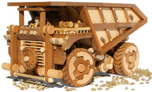
The BIG Truck Plans