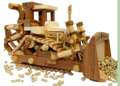
The BIG Dozer Plans

All plan books include scale drawings of every part, hundreds of procedural photographs, and complete instructions.