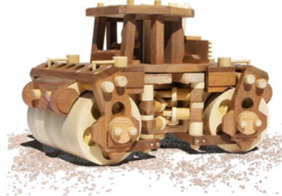
The BIG Steam Roller Plans