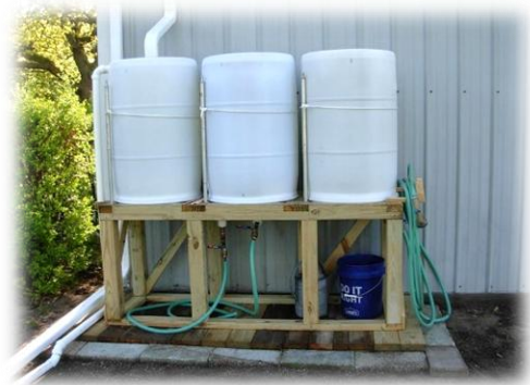
Red Oak Burl Bowl / White Oak Charred Cup / Rainwater Capture System